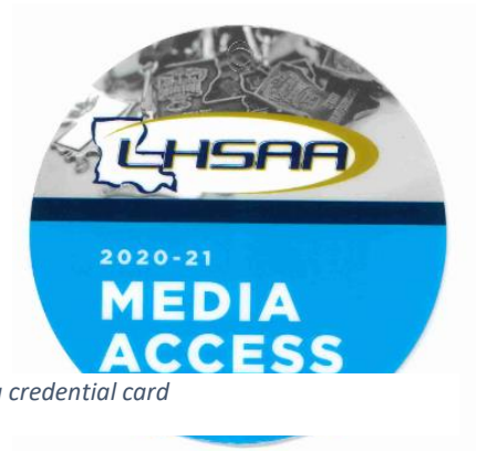
Hard media credential card

2019-20 Media Access cards not accepted.